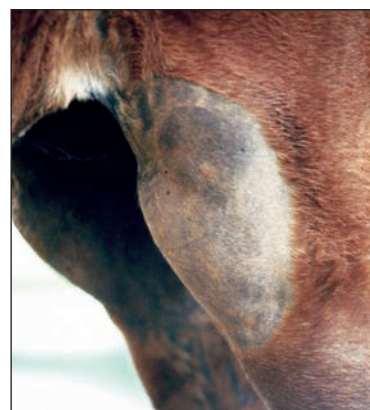
Visible stifle joint distention

Commercially available nutritional supplements high in copper are available and have mixed therapeutic results. Qualified professional advice is recommended prior to choosing the best treatment for horses affected with OCD problems. Ⓞ