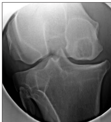
Radiograph stifle OCD on femur

OCD cyst-like erosions of bone are single circular areas of decreased bone density, seen on radiographs, and found within the ends of bones, contained within joints. These weakened cystic areas of bone, which can create joint abnormalities, may lie just below the surface of what appears to be normal articular cartilage, or they may involve deterioration and/or loss of what should otherwise be normal joint cartilage. Technically, OCD also includes fractured composite pieces of bone and cartilaginous joint fragments that do not have to be associated with a bone cyst.